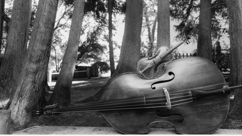
PARTING GLASS -TRADITIONAL SCOTTISH